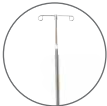
IV POLE Left, Right, or Dual